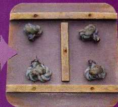
Mud patten - bottom view