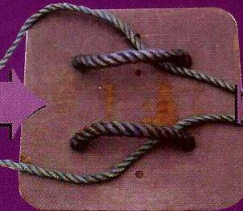
Simultaneously pass the tie ends under the board loops from the outside