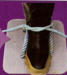
Bring the ends of the rope up over your instep and make a turn