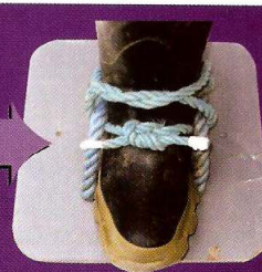
Pass the rope ends under the loops and tie off over the instep with a reef knot