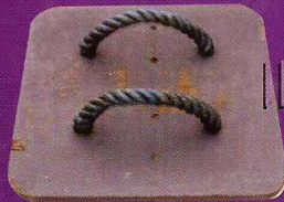
A well used mud patten - top view